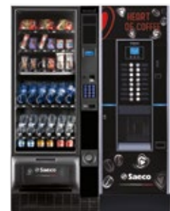
Artico S + Cristallo Evo 400